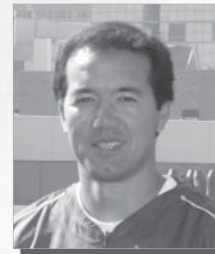
John Farr Strength & Conditioning

The J.D. Morgan Center houses coaches, staff and administrators, supporting all 22 of UCLA's intercollegiate athletic teams.