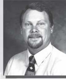
Paul Brown Event Management